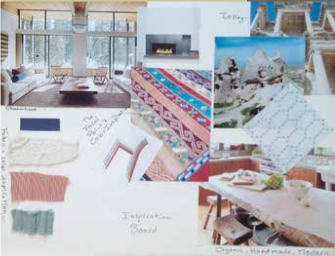
Elza B. Design, Inc.

Unless your renovation is limited to updating existing finishes, you may need a professional designer to develop plans. Your designer should be familiar with local building codes and relevant community historic commission and zoning requirements so you don't spend time on plans that won't be approved.